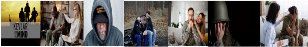
TBI/PTSD Veterans can finally be treated with something different than off-label prescription medications! Could this be you?

Have you been knocked unconscious in combat, exposed to IEDs, explosions, or sexually assaulted? Are you suffering from routine migraine headaches, sensitivity to light, having memory issues, trouble finishing sentences, difficulty expressing thoughts, self medicating? If so, you are only one of over an estimated 877,450 TBI/PTSD Veterans across America suffering from TBI/PTSD in the same manner.